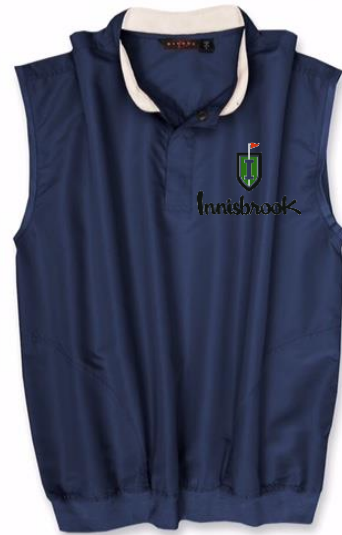
MEN'S STYLE: 788UHV Windvest

- MEN'S WIND AND WATER TOURNAMENT TESTED OUTERWEAR -