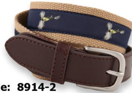
Style: 8914-2 Fabric Fly Fish belt / Brown