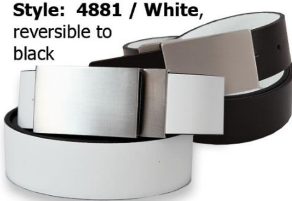
Style: 4881 / White, reversible to black