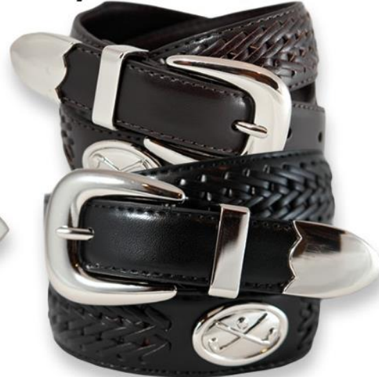
Style: 9024-1 / Black - Hand leather laced sections with oval golf ornaments

Style: 8905-1 stretch Braid belt / Brown