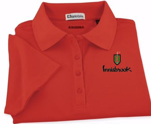
LADIES STYLE: 215L Four-Button, Open Sleeve SIZES: S-XL All colors except Purple.