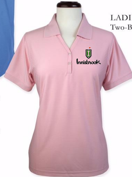
LADIES STYLE: 405V Two-Button, Banded Sleeve SIZES: S-XL

OUR BEST SELLING PERFORMANCE POLO FOR BOTH MEN AND WOMEN. MADE IN OUR DRI-WAY MOISTURE MANAGEMENT SYSTEM OF 95% COOLMAX AND 5% SPANDEX. THIS TEXTURED STRIPE FABRIC IS THE ULTIMATE IN COMFORT AND EASY CARE. AVAILABLE IN 20 COLORS.