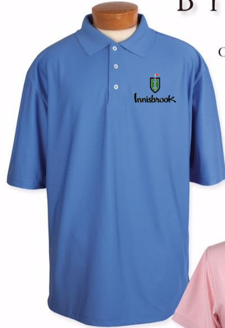
MEN'S STYLE: 405 Three-Button, Open Sleeve SIZES: S-XXL

All colors available in mens. XXXL available in select colors: BLACK CHARCOAL CRIMSON NAVY RED SKY WHITE