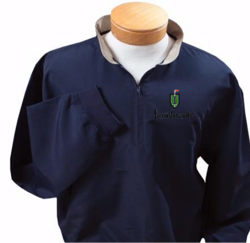
1/4 ZIP MICROFIBER TEFLON COATED WATER REPELLENT SWING QUIET FABRIC SIZES: M-XXL