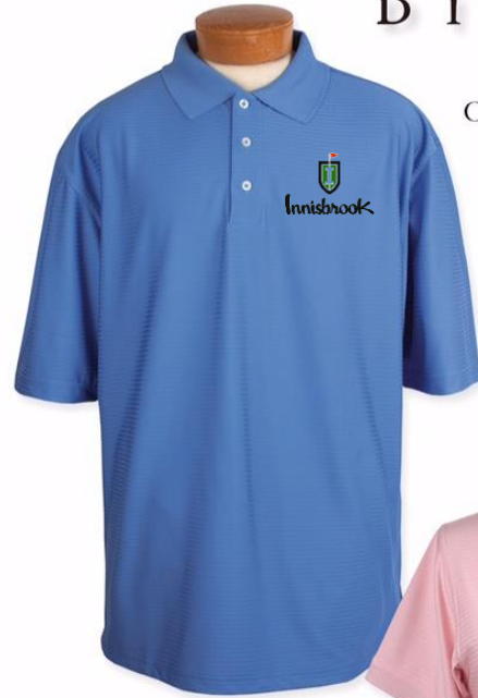
MEN'S STYLE: 405 Three-Button, Open Sleeve SIZES: S-XXL

All colors available in mens. XXXL available in select colors: BLACK CHARCOAL CRIMSON NAVY RED SKY WHITE