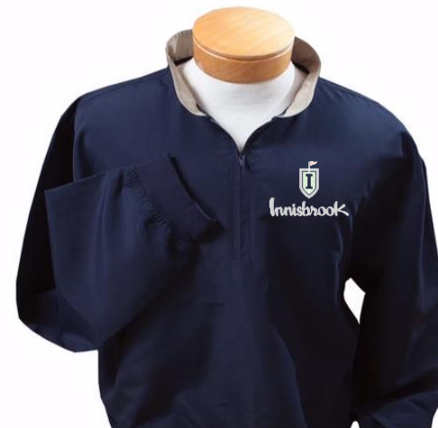
MEN'S STYLE: 777MZ Windshirt

1/4 ZIP MICROFIBER TEFLON COATED WATER REPELLENT SWING QUIET FABRIC SIZES: M-XXL