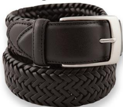
Style: 8905-1 Stretch Braid belt / Brown