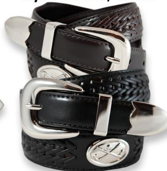
Style: 9024-1 / Black - Hand leather laced sections with oval golf ornaments

Braid belt / Brown Style: 8905-1 stretch