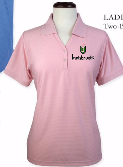
LADIES STYLE: 405V Two-Button, Banded Sleeve

OUR BEST SELLING PERFORMANCE POLO FOR BOTH MEN AND WOMEN. MADE IN OUR DRI-WAY MOISTURE MANAGEMENT SYSTEM OF 95% COOLMAX AND 5% SPANDEX. THIS TEXTURED STRIPE FABRIC IS THE ULTIMATE IN COMFORT AND EASY CARE. AVAILABLE IN 20 COLORS.