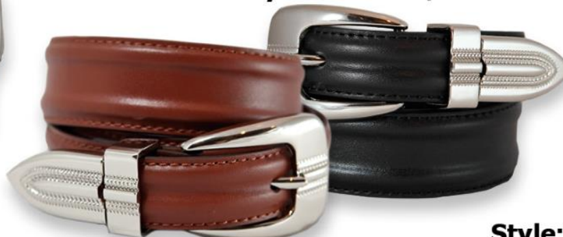
Style: 8911-2 / Brown