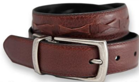
Style: 4880-21 / Brown-Black - Reversible, bow-tie lacing, feather edged