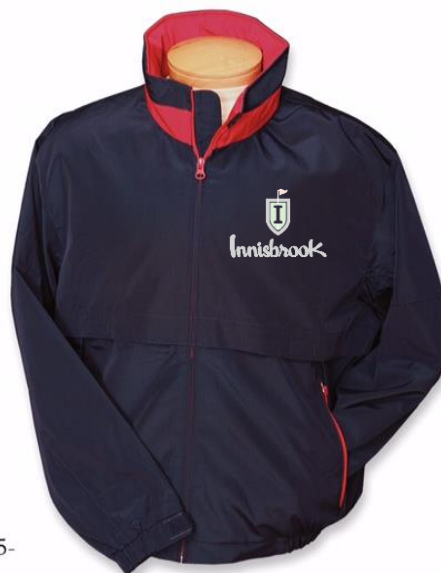
STYLE: 6037 100% POLYESTER WATER REPELLANT WIND JACKET WITH HIDDEN HOOD MEN'S SIZES: M-XXL