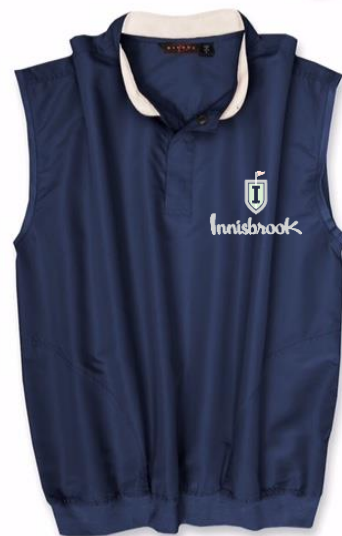
MEN'S STYLE: 788UHV Windvest

- MEN'S WIND AND WATER TOURNAMENT TESTED OUTERWEAR -