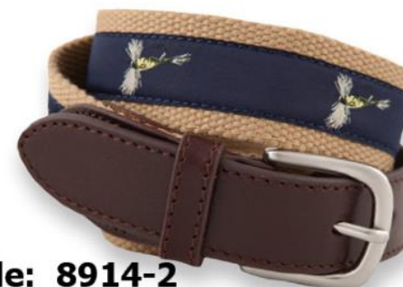
Style: 8914-2 Fabric Fly Fish belt / Brown